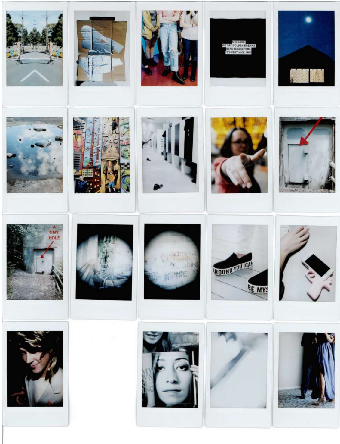
Janet Lilo, 1000 grams , preliminary layout, 2016, Instagram images printed on Instamax film